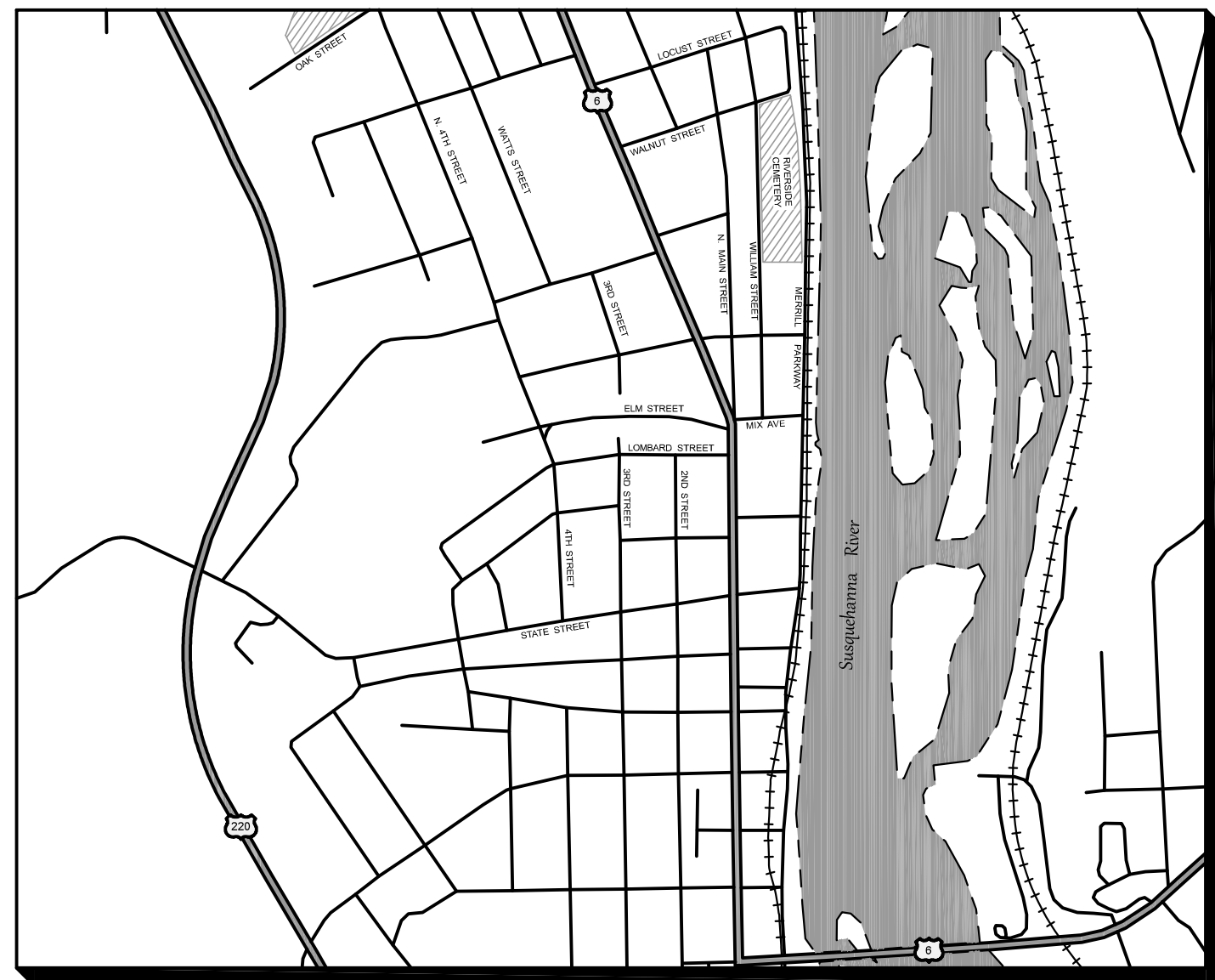
LOCATION MAP 1" = 1,000'